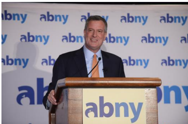
Bill de Blasio, New York City Public Advocate and Mayor-Elect of New York City October 4, 2013 | Marriott Marquis