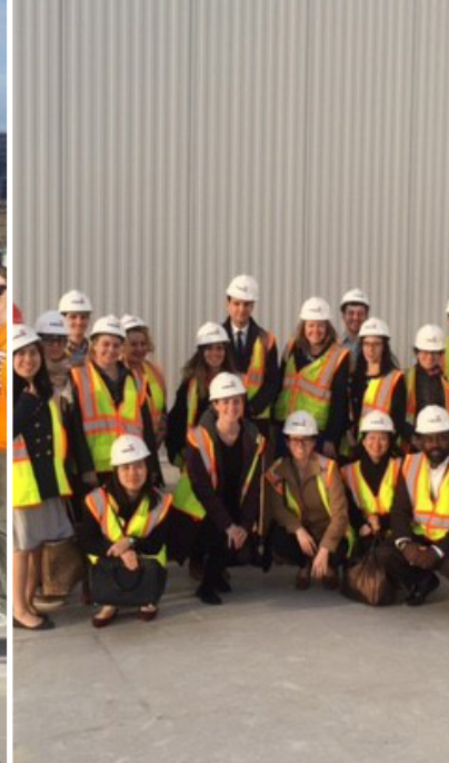
Fresh Direct Tour