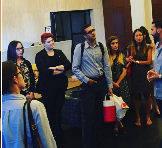
We Live Tour