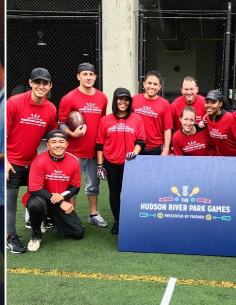
Hudson River Park Games