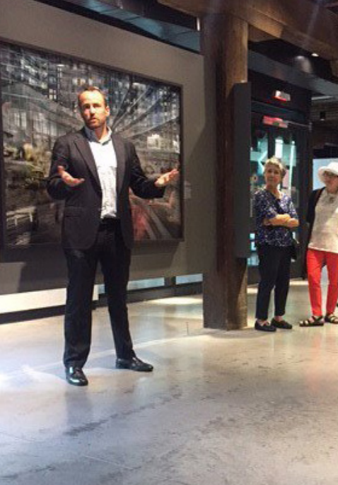
Brooklyn Historical Society Tour