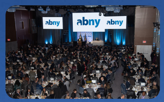
Check out ABNY Member events here.

ABNY Members: ABNY's signature programs include Power Events, Special Briefings, and ABNY Talks. ABNY Power Events offer an opportunity for elected and government officials, as well as civic and business leaders, to present the ideas and policies they believe can help foster a better New York. ABNY Special Briefings are member-only events where government, business, and civic leaders update ABNY members on pressing issues and solicit feedback and input from the membership. ABNY Talks events are educational events open to all in the ABNY network (members and non-members) and are free of charge.